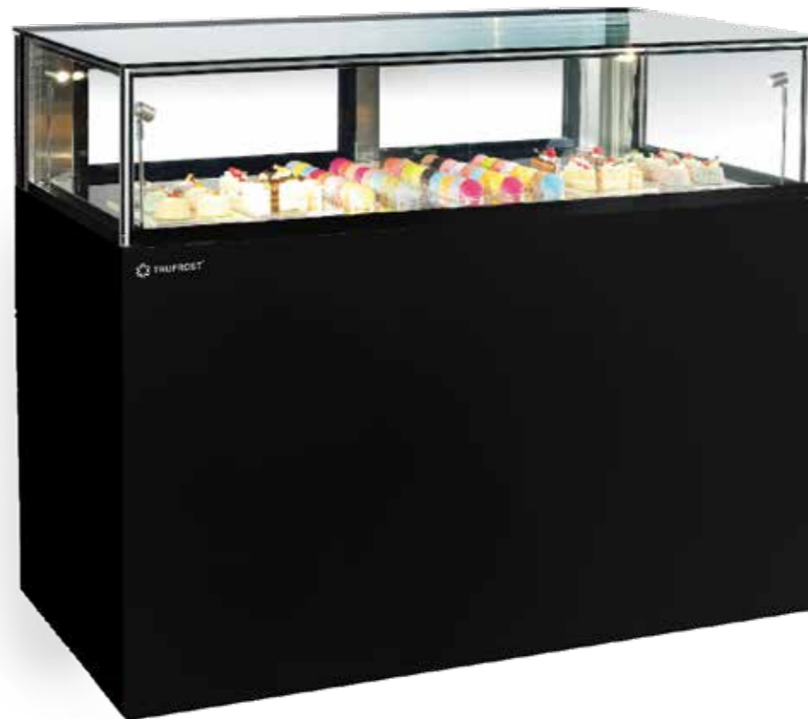
Diva 900 Premia

Inspired by the jewellery shop and high-end fashion boutiques, this jewellery box type display showcase from Trufrost is perfect for gorgeous creations especially, exotic pastries and chocolates. It has two refrigerated pull-out drawers at the rear and brilliant LED lighting to enhance the display. It also comes with an additional refrigerated storage underneath the drawers. You can place multiple units together to give a magical look to your store's ambience.