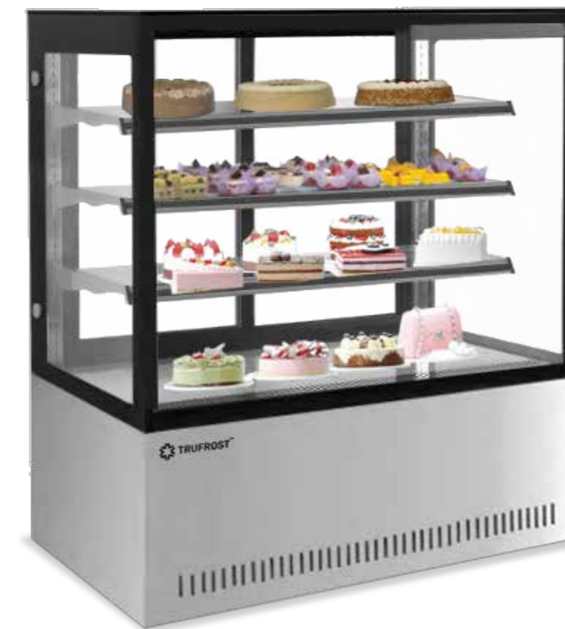
CSF 44 WSF 44