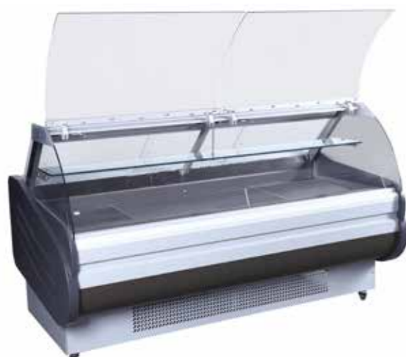
Openable front glass

Trufrost presents stylish serve over counters for display of a variety of foodstuff including delicatessens, dairy products, sausages, meat and poultry that ensure maximum visibility in a pleasing manner. The front glass can be lifted for cleaning. They also come with an additional refrigerated storage underneath which can be accessed through specially provisioned small door/s at the rear.