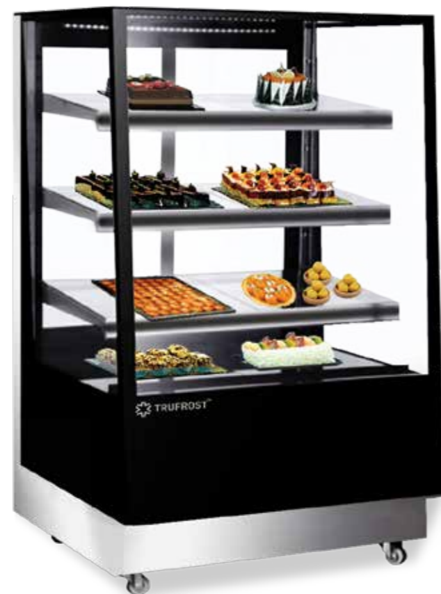
Temptation 44 Temptation 44W