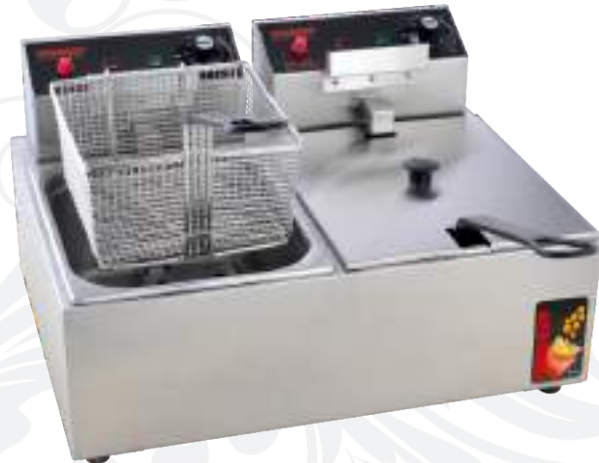
Electric Deep Fryer Double Pan