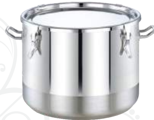
Casserole Medium / Cook Pot Medium – with Lock